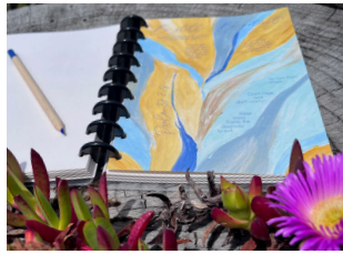
BEAUTIFUL CALMING ARTWORK