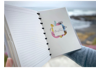
CONVENIENT FOUR NOTEBOOKS IN ONE